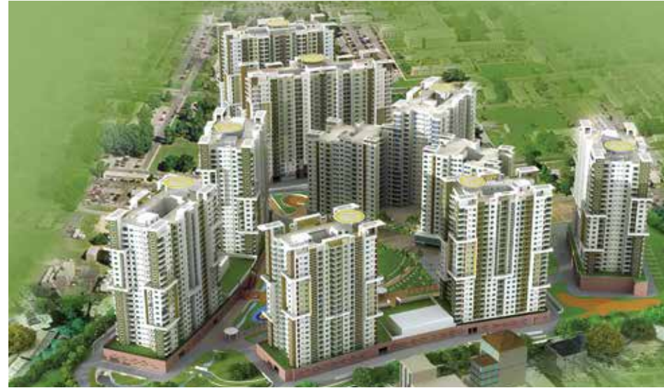
Greenage, Hosur Main Road