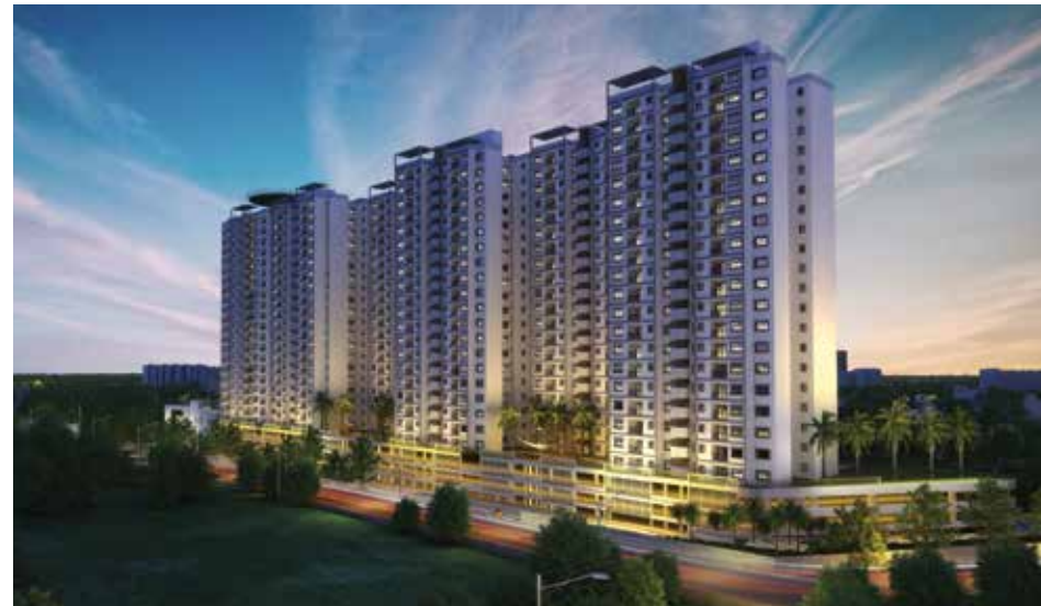
Cadenza, Kudlu Gate Junction