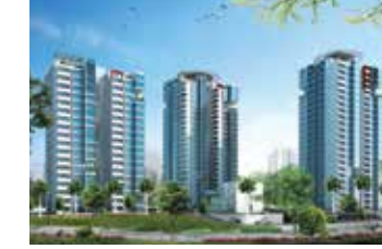
Magnificia, Old Madras Road