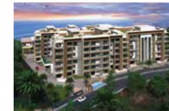
Water's Edge, Goa