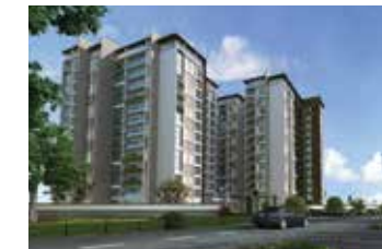
Aspire, Hennur Main Road