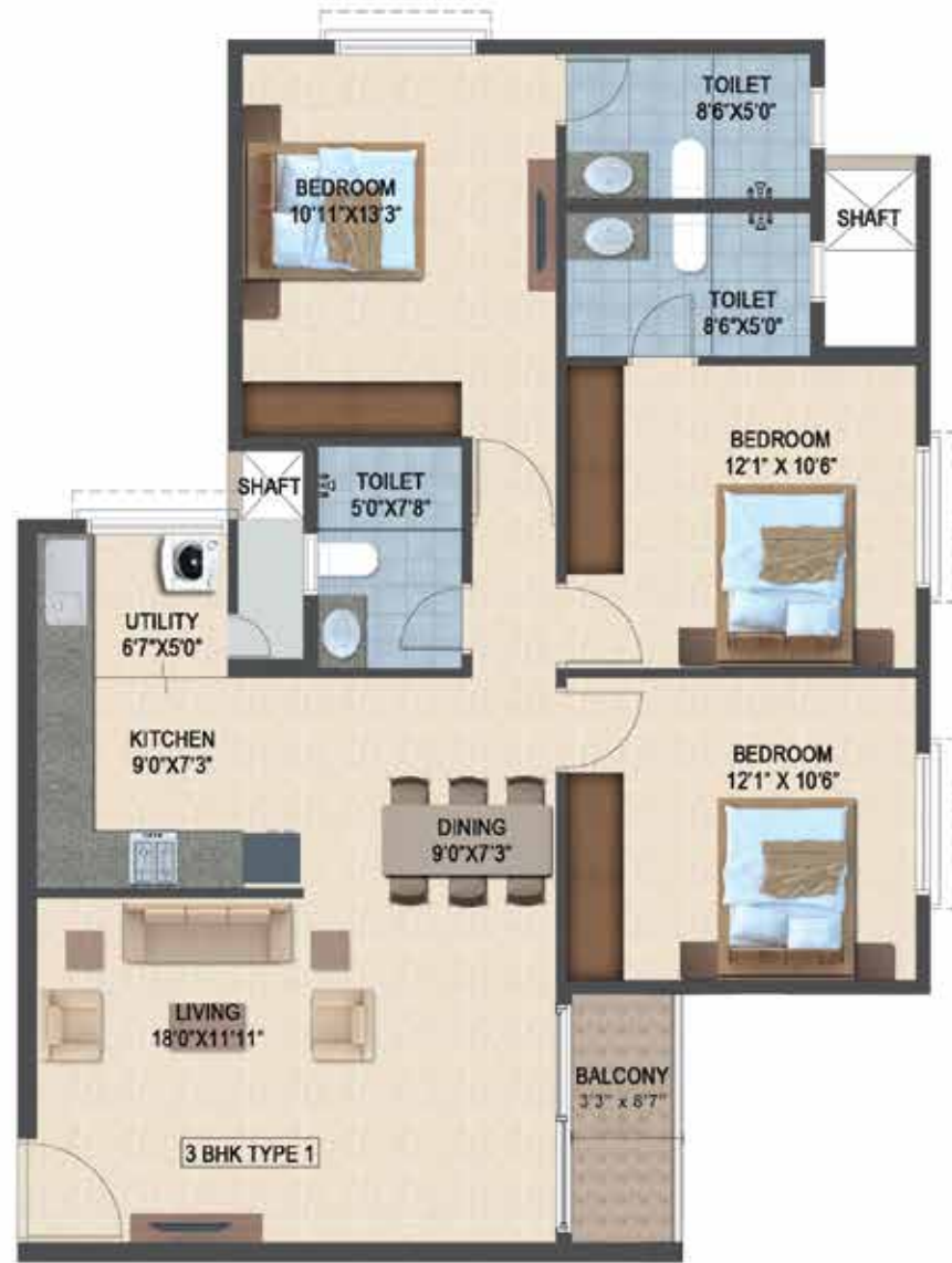
1354 SFT 3 BHK TYPE-1