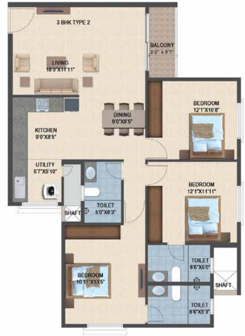
1416 SFT 3 BHK TYPE-2