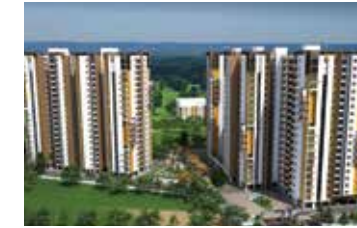
Senorita, Sarjapur Main Road