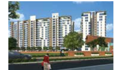
Navaratna Residency, Coimbatore