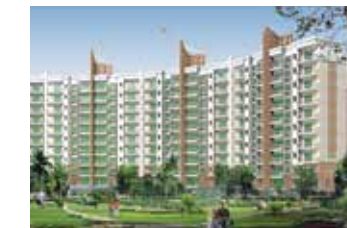
H & M Royal, Pune