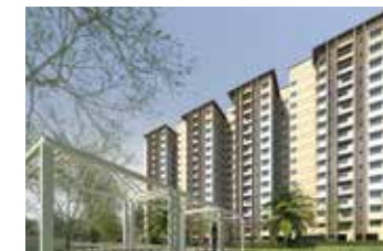
Necklace Pride, Hyderabad