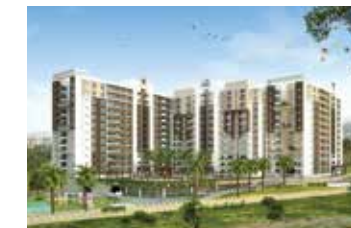
Celesta, Old Madras Road