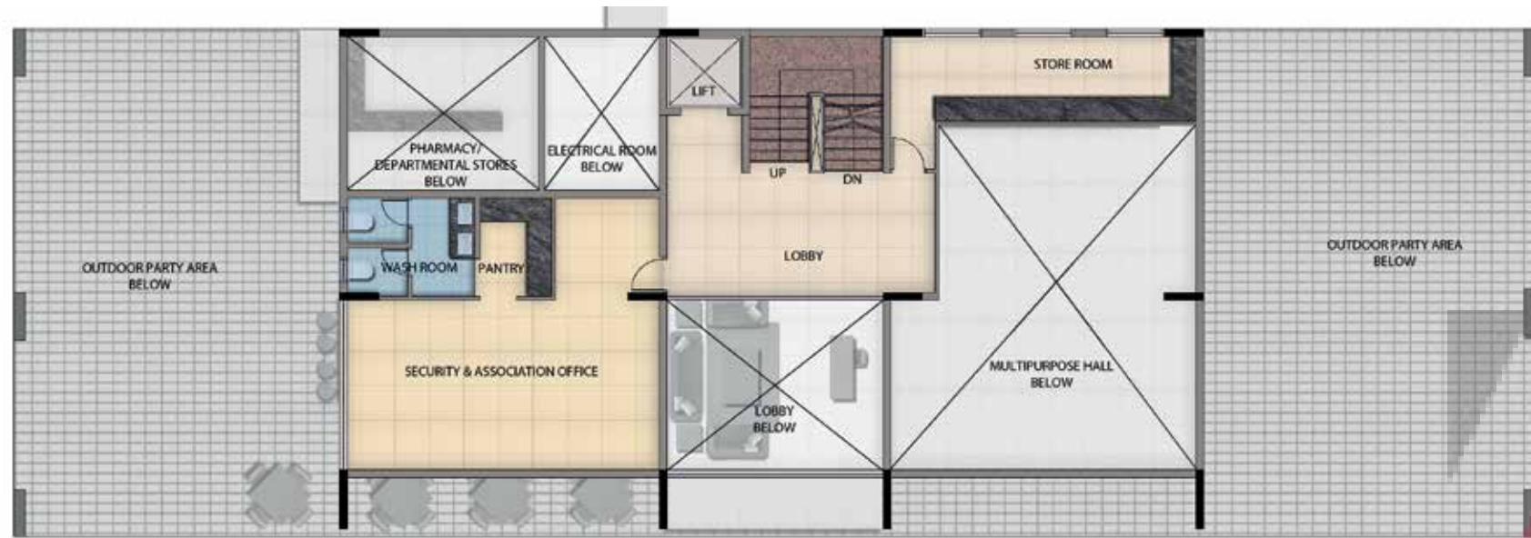
Mezzanine Floor Plan